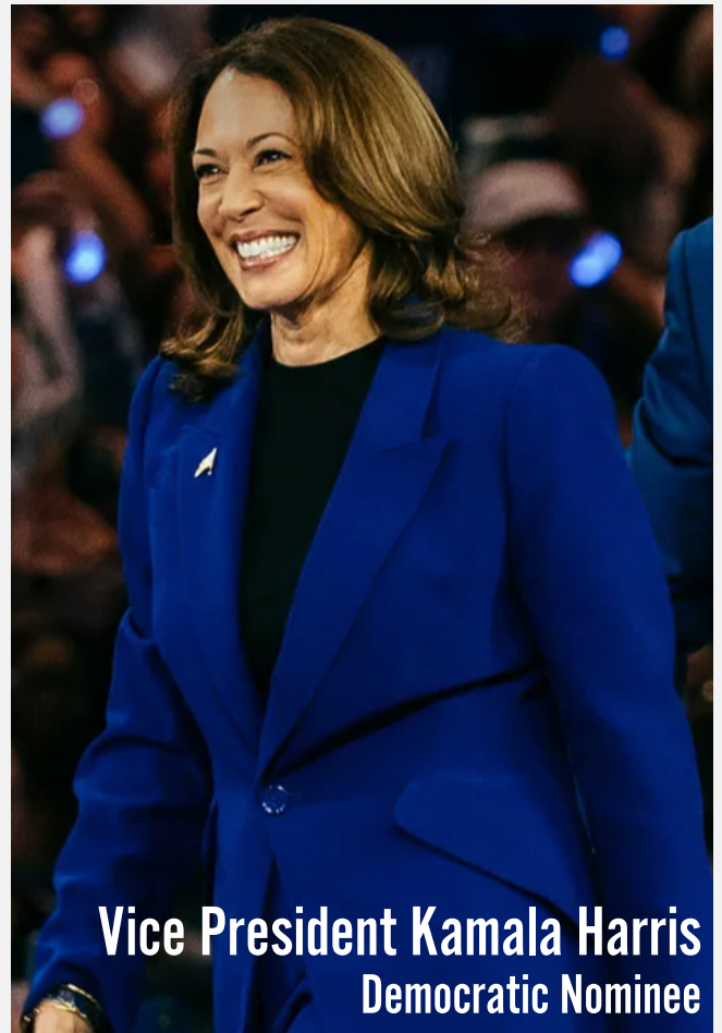
Vice President Kamala Harris Democratic Nominee