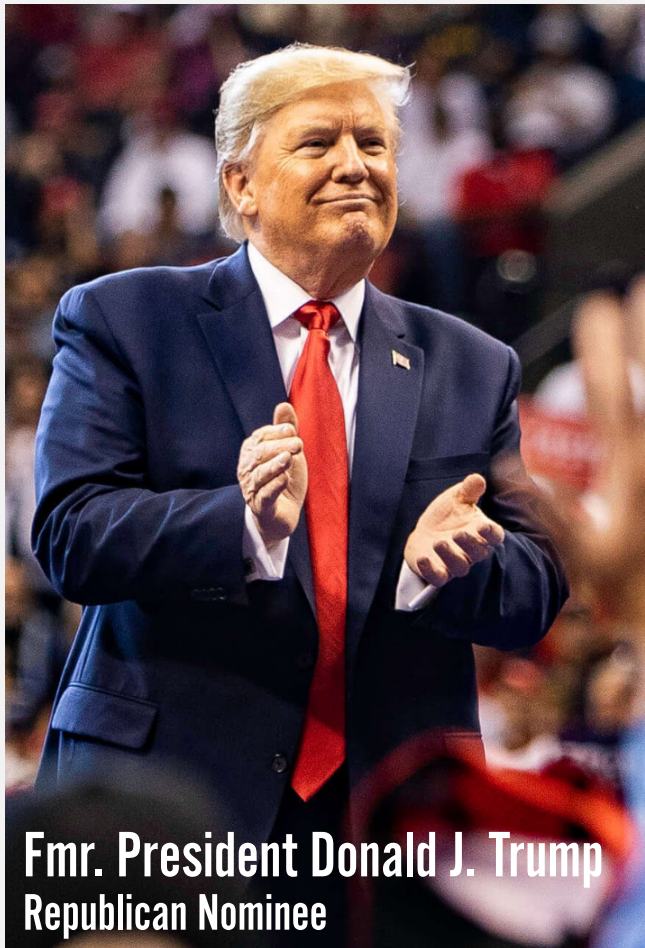
Fmr. President Donald J. Trump Republican Nominee